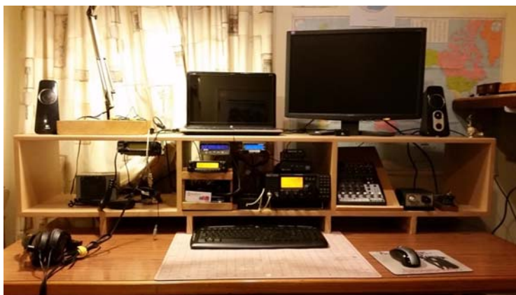
73 Don ZL3DMC

Mid-Winter Dinner - Sunday 9th August @ 1200hrs Garden Restaurant, Marshland Road, Shirley